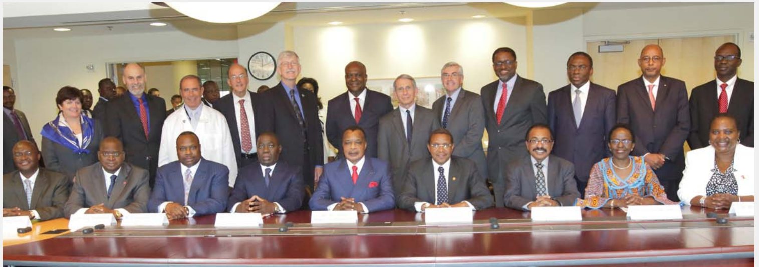
NIH officials met with the Presidents, ambassadors and other government officials from Tanzania and the Republic of the Congo in the Clinical Center Aug. 2.

The President of Tanzania, Jakaya Mrisho Kikwete, the President of the Republic of the Congo, Dennis Sassou Nguesso, the President of Mali, Ibrahim Boubacar Keita, the Zambian Vice President, Guy Scott, and other ambassadors and government officials from Africa visited the NIH Clinical Center Aug. 2 and Aug. 7. These leaders, along with over 45 additional African heads of state and government, were in the Nation's Capital for the U.S.-Africa Leaders Summit. During their visit,