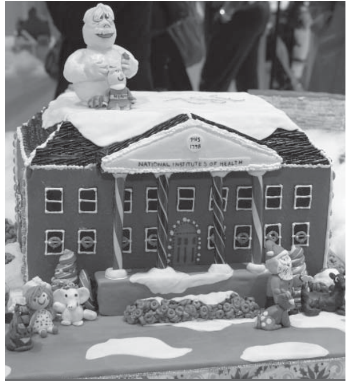
The 7SE patient care unit won third place in the annual competition for their gingerbread re-creation of Building 1.