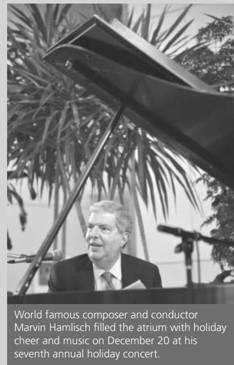
World famous composer and conductor Marvin Hamlich filled the atrium with holiday cheer and music on December 20 at his seventh annual holiday concert.