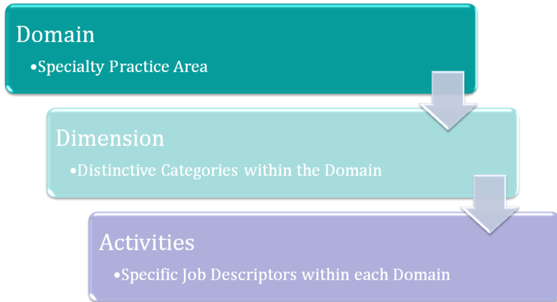
Figure 1: Taxonomy Structure

A taxonomy was developed to classify concepts and roles within the specialty domain of practice. The taxonomy consists of three levels moving from broad to more specific concepts ( Figure 1 ). The domain, clinical research nursing, represents the specialty practice area for nursing. The dimension identifies distinct categories within the specialty domain. The activities are specific job descriptors within each dimension.