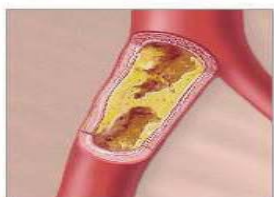
Blockage in right coronary artery